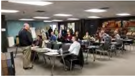
Such a great bunch, listening attentively!!