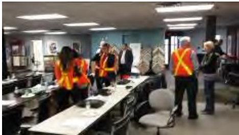
Before we go, SAFETY FIRST!!