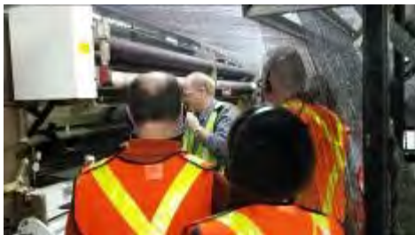
The tour in progress... So that's how they do it...