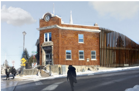
CONCEPTUAL FRONT OF BUILDING