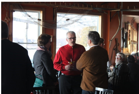
"Wanna hear a construction joke? Sorry, I'm still working on it."