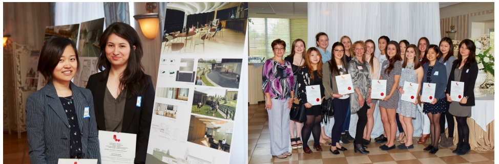
WINNING ENTRANT—SOUNDWAVE WITH THEIR DESIGN BOARD