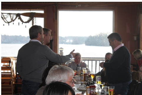
Socializing, Networking, and LUNCH?! Well worth the price of admission!