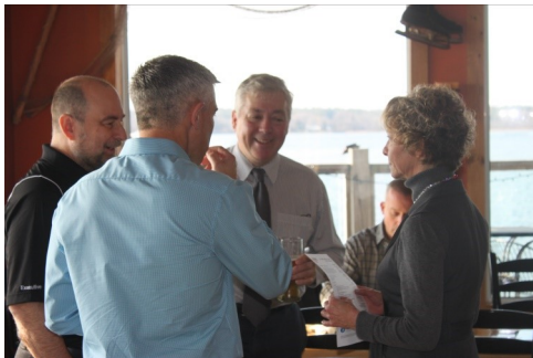
"So I asked her, 'Do you love me?' and she said, 'No! But that's a really nice ski mask.'"