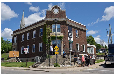
RECENT PHOTO OF ACTUAL FHM