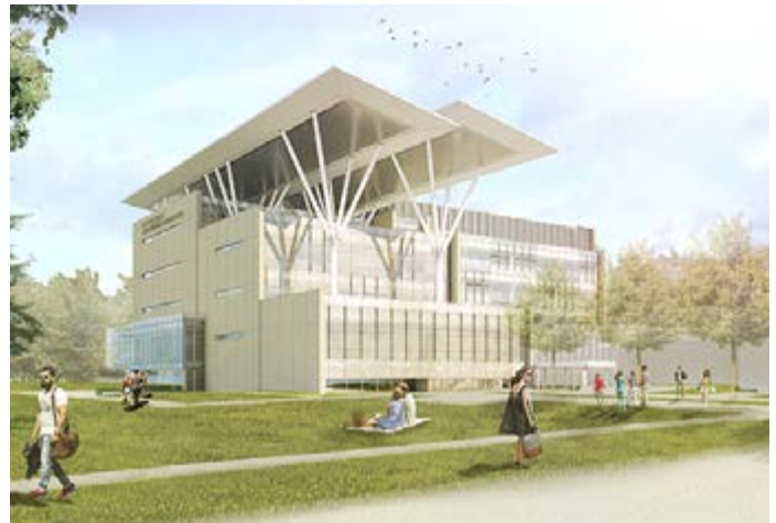
Mohawk College, Joyce Centre for Partnership & Innovation, Hamilton, Ontario.