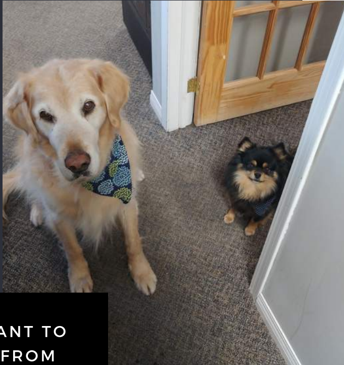
Beau and Charlie, Ambassador Sales Inc.'s mascots