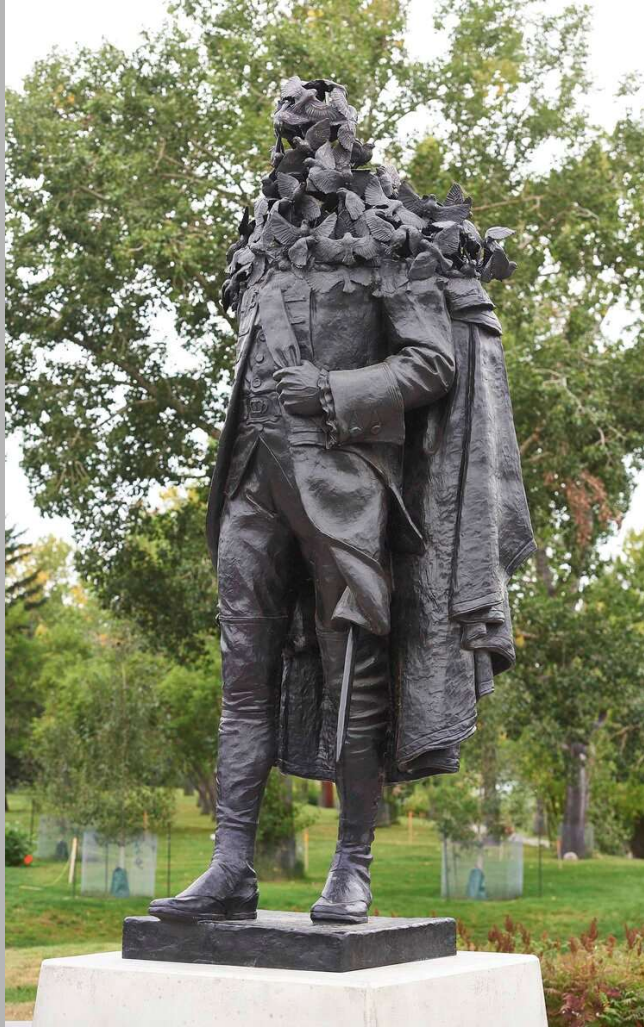
Wolfe and the Sparrows Sculpture. Inglewood, AB