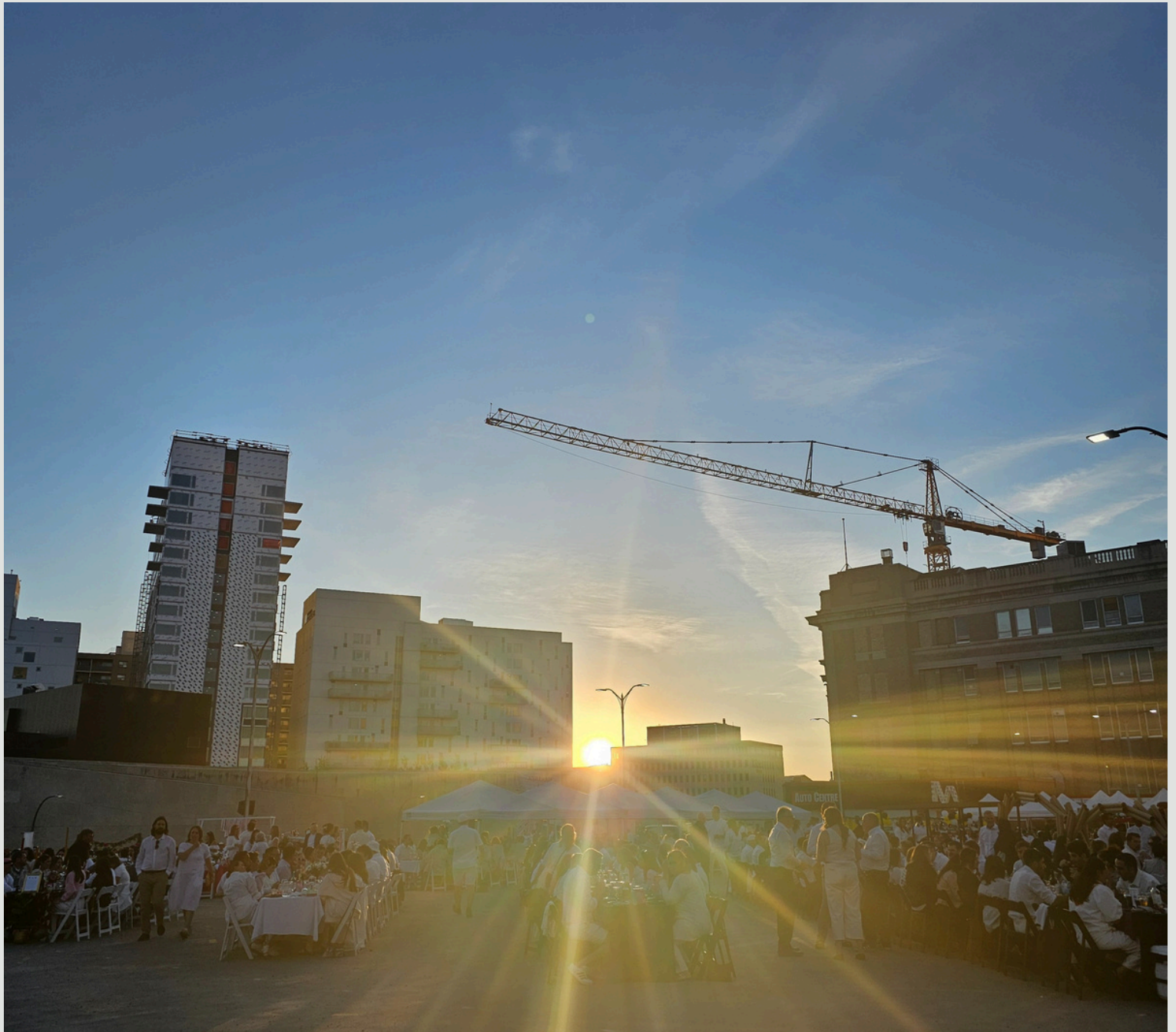
Table for 1200 held May 24, 2025

CSC's mission is to educate, connect and lead the design and construction community to achieve excellence in project delivery.