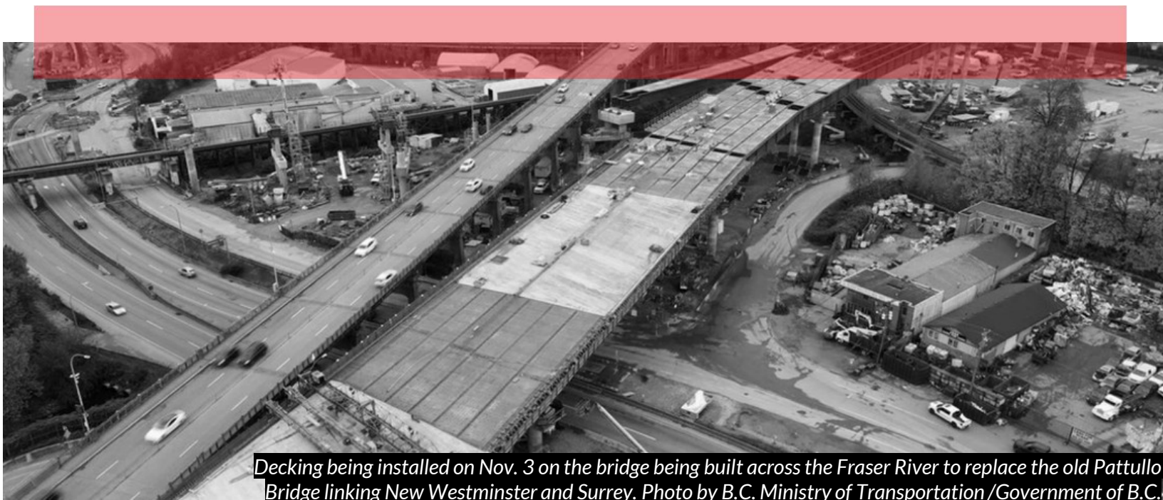
Decking being installed on Nov. 3 on the bridge being built across the Fraser River to replace the old Pattullo Bridge linking New Westminster and Surrey.